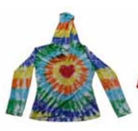
Girls Cotton-Lycra Tie Dye Hoodie $16